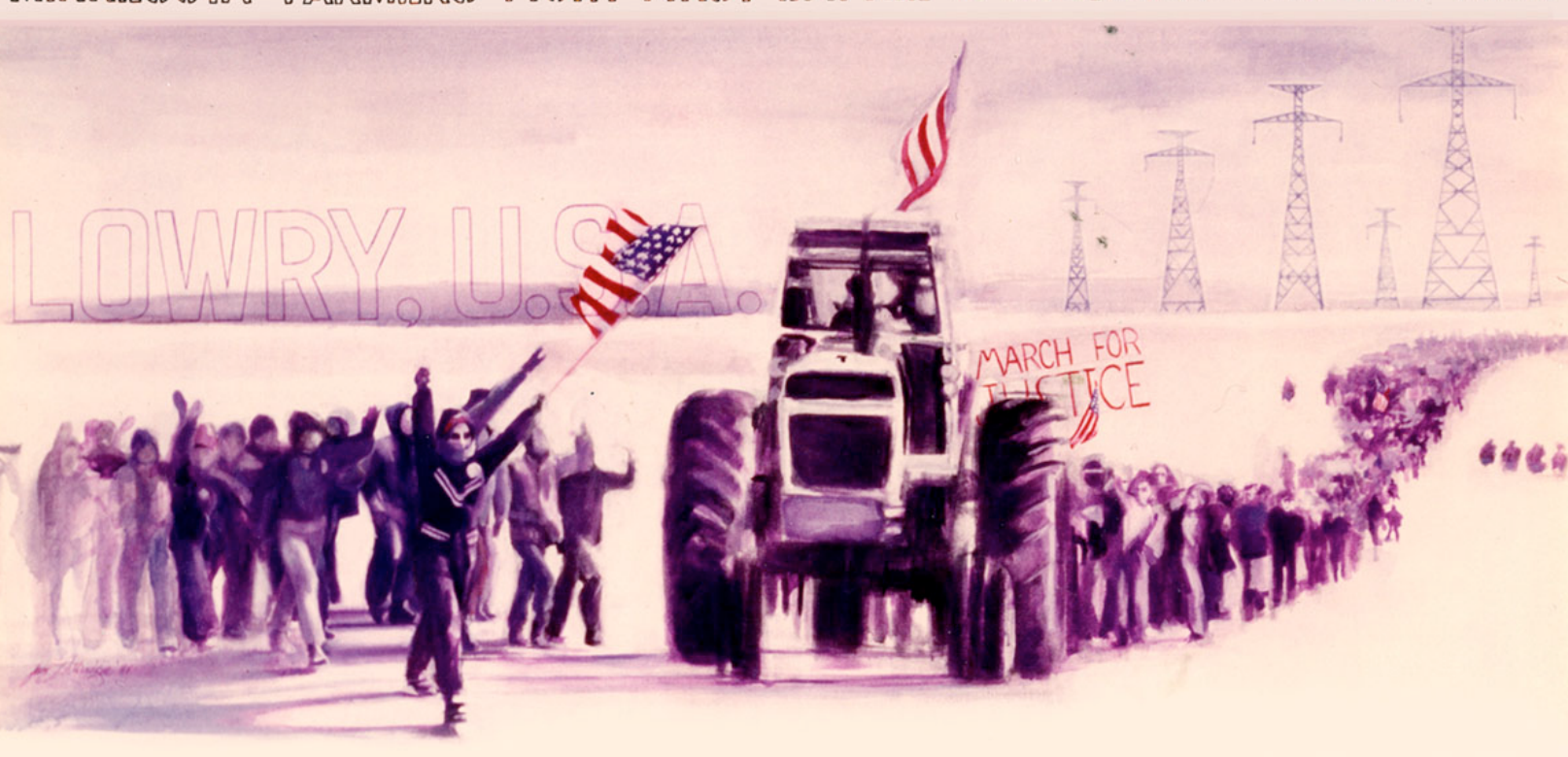
40th Anniversary West Central Minnesota Powerline Protestors Reunion

MINNESOTA FARMERS FIGHT FIRST BATTLE OF AMERICA'S ENERGY WAR